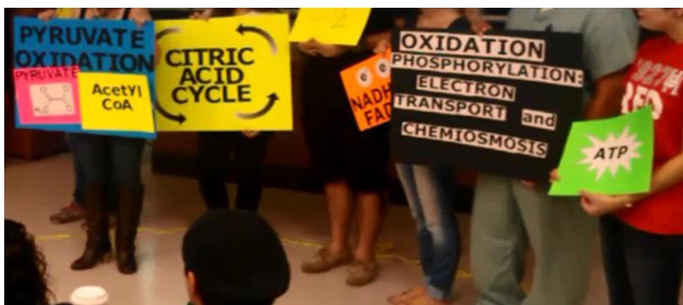
Figure 6. Students participate in a review of cellular respiration.

oxidation board (attach with the Velcro™). The “2 Acetyl CoA” board should be added next. Have the second “2 NADH” student stand next to the pyruvate oxidation board.