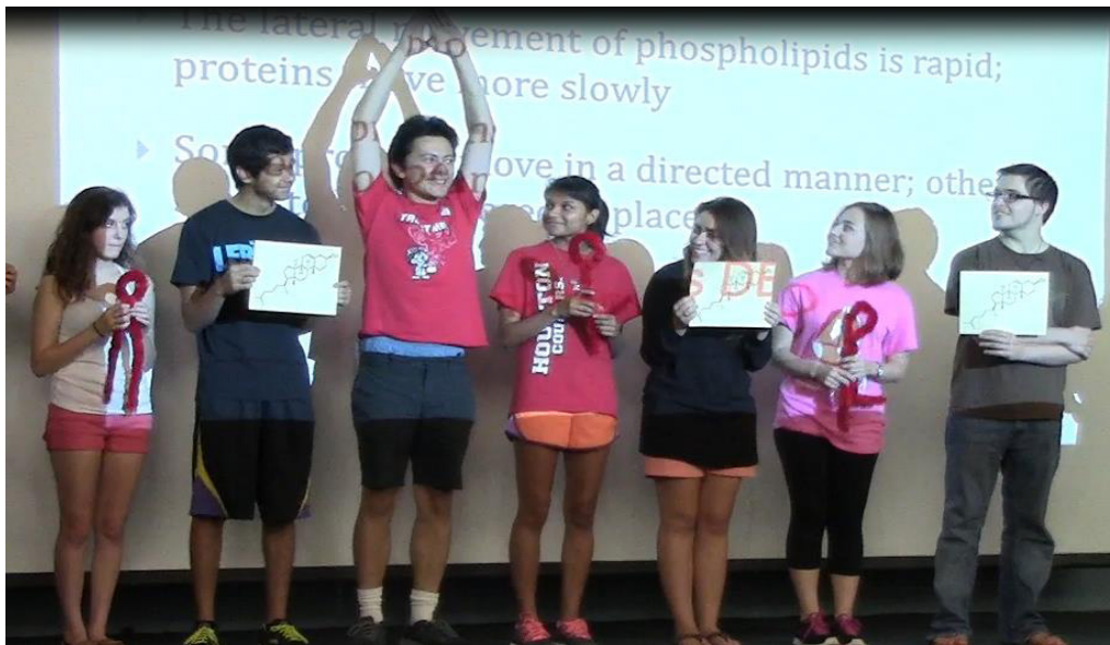
Figure 4. Students participate in a model of lipids, cholesterol, and a transmembrane protein.