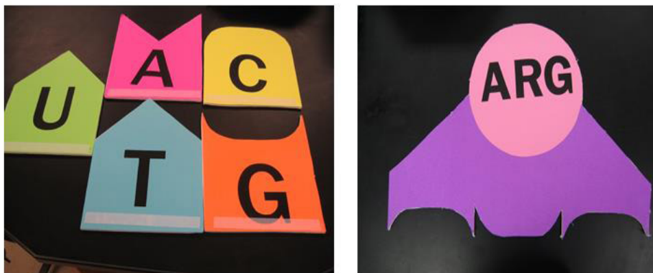
Figure 2. Nucleotide letters are cut and pasted onto foam board. Velcro™ is added in a strip at the bottom of each nucleotide so that the pieces can be attached to the poles serving as the DNA or RNA backbone.