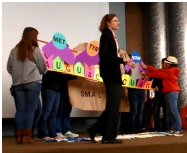
Figure 3. Students in an introductory biology lecture course participate in a review of the processes of transcription and translation.