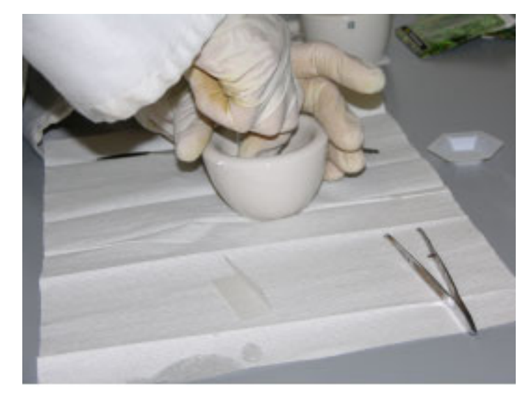
Figure 1. Seed preparation. After weighing, seeds are ground up with a mortar and pestle.

Seeds from different plant families are commercially available. After rinsing and drying, seeds are weighed (0.5g) and ground with mortar and pestle (Fig. 1). The mash is mixed with 3-5 ml distilled water for 2 minutes over ice. Since seeds are biochemically diverse, the volume of water necessary will depend on the presence of a visible slurry. The slurry is briefly vortexed and centrifuged at 10,000 rpm (4°C, 2 X 10 min). Supernatant aliquots are delivered into separate microfuge tubes by decanting. This point can be considered a "stop point" and the samples may be frozen for later analysis.