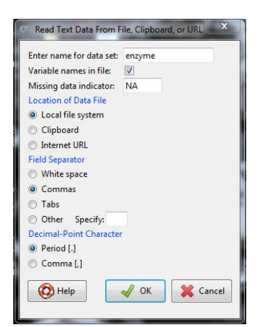
Figure 1. Screenshot of data import dialog box in "R".