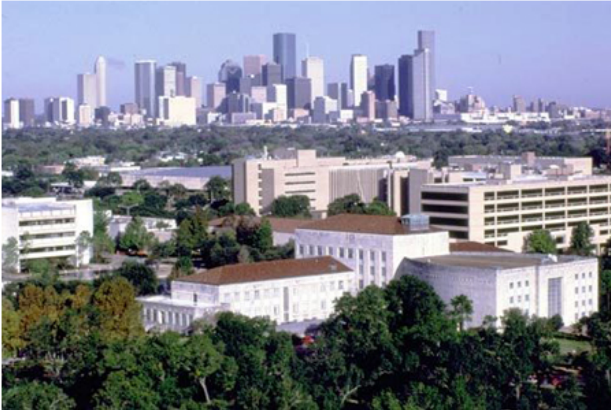
Houston's skyline as seen from UH