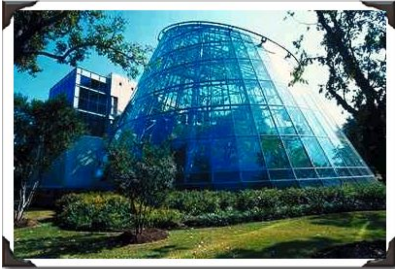
Cockrell Butterfly Center