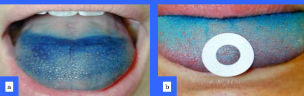
Figure 1. (a). Anterior tongue stained with blue food coloring. Fungiform papillae appear pink. (b) Adhesive reinforcement label placed on the tongue tip. Papillae are counted in the encircled area.