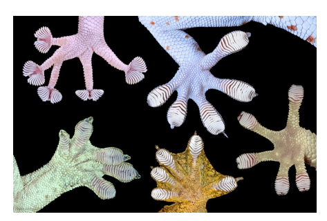
Figure 1. The feet of different species of gecko lizards vary in structure.

We can make similar predictions based on the head shape of fish. Look at the fish on the following page and answer the questions that follow.