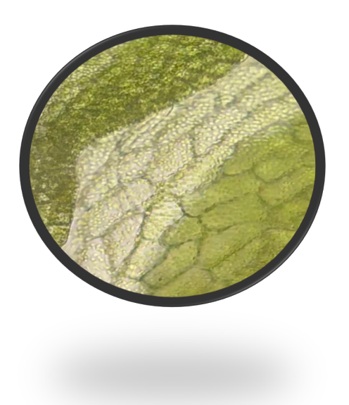
Figure 3 . C-fern gametophyte in water, depicting an even distribution of chloroplasts (400 X).